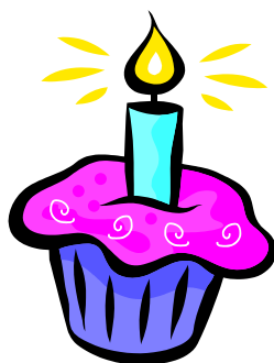
Sweet Apple Sweetcakes